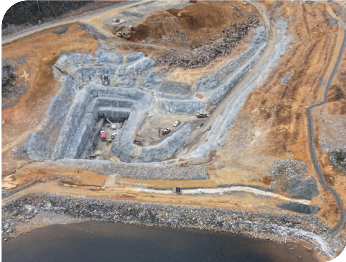
An aerial view of the intake excavation where the new intake tower will be constructed.