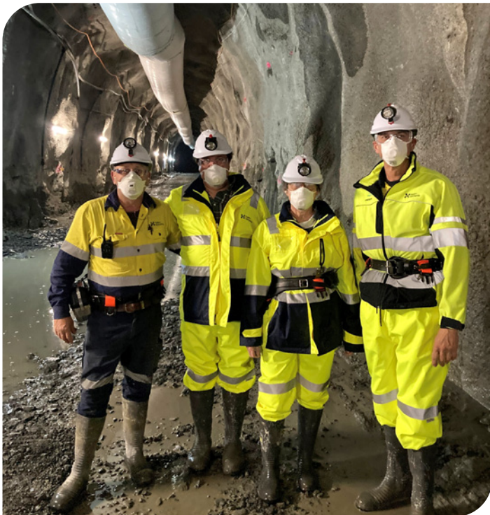
Our team checking out the tunnel progress!

The 950 metre tunnel linking Lake King William up to future new infrastructure is also complete. Tasmanian company Hazell Bros Group teamed up with Tunnelling Solutions to make it happen, drilling and blasting their way through about 100,000 tonnes of material!