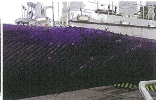
Photo 6. Secondary bulge oozing compound