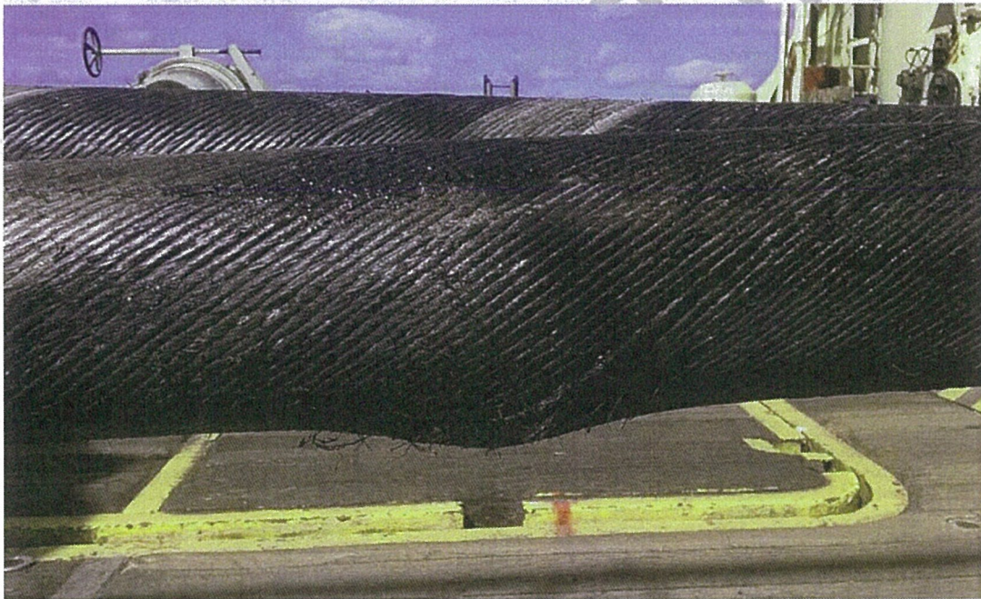
Photo 4. Side view of fault.