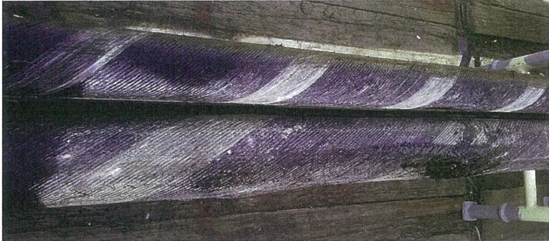
Photo 3. Fault position viewed from top.