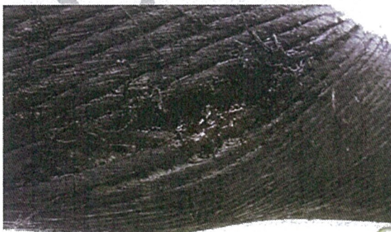
Photo 5. Fault from underneath