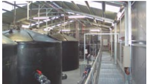
Vanadium Redox Battery System with the tanks containing electrolyte in the foreground and a bank of cell stacks at the far end of the building.

The expanded Huxley Hill Wind Farm provides a total installed capacity of about 2.5 MW of wind generation.