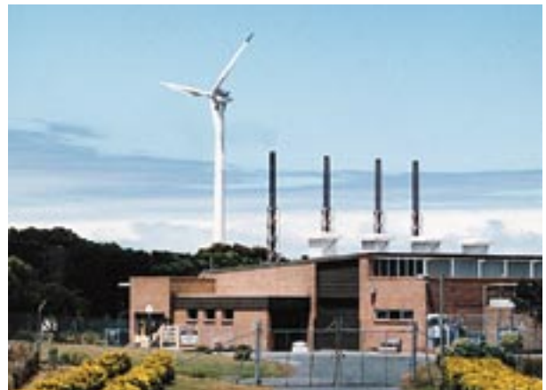
Nordex wind turbine in front of diesel power station.